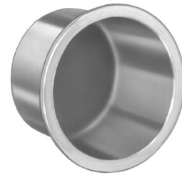
ANCHORING METHOD FOR WALLS UP TO 4-3/4" THICK