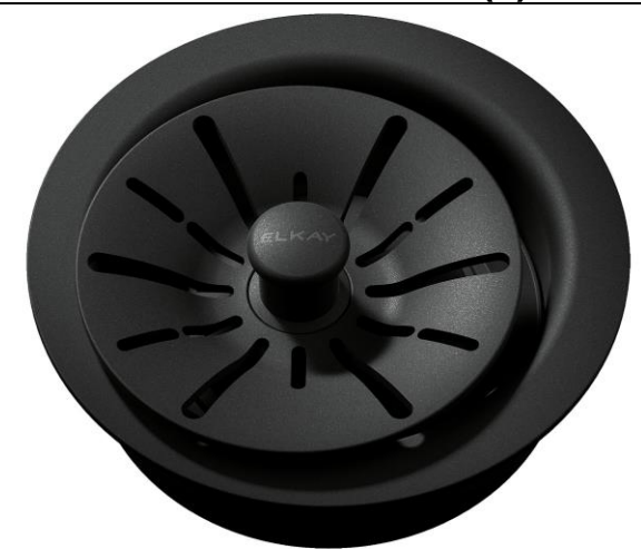
AMERICAN PRIDE. A LIFETIME TRADITION. Like your family, the Elkay family has values and traditions that endure. For almost a century, Elkay has been a family-owned and operated company, providing thousands of jobs that support our families and communities.