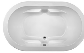
Shown with optional integral armrests