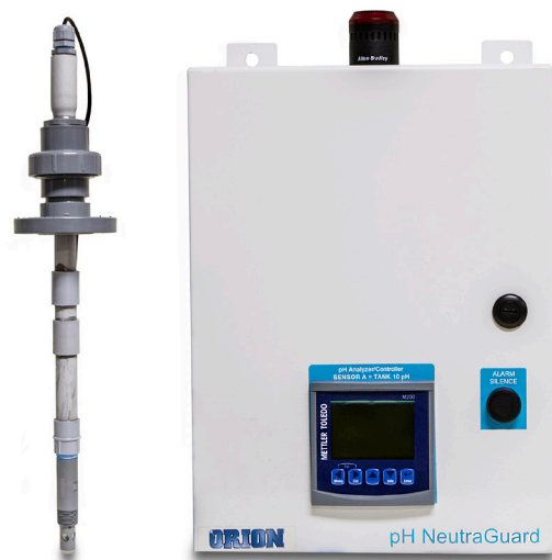
12" L x 16" H x 7" D

For System model selections please consult chart on next page.