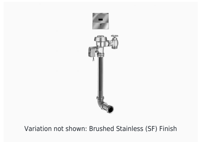
Variation not shown: Brushed Stainless (SF) Finish