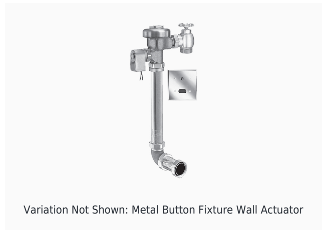
Variation Not Shown: Metal Button Fixture Wall Actuator