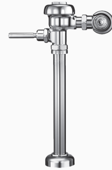
Variation Not Shown: Trap Primer