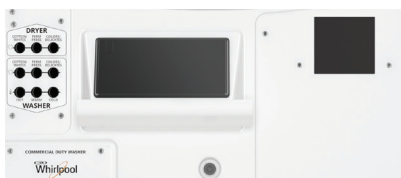
CET9100GQ / CGT9100GQ