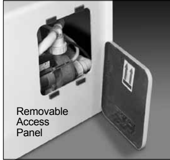
Removable Access Panel