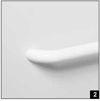
Grab Bars: Factory-installed 1.50-inch diameter, concealed attachment, 18 gauge, #304 brushed stainless steel grab bars. Concealed Photo 1: attachment design provides tamper-resistance and minimizes debris collection areas at contact points, compared to common exposed flange bar designs, without compromising bar attachment integrity. (Reinforced areas include a structural core material encapsulated in FRP composite.)

Photo 2: Grab Bars: Factory-installed 1.25-inch dia. powder coated (in finishes listed above), concealed attachment, 18 gauge, #304 stainless steel grab bars. Concealed attachment design provides tamper-resistance and minimizes debris collection areas at contact points, compared to common exposed flange bar designs, without compromising bar attachment integrity. (Reinforced areas include a structural core material encapsulated in FRP composite.)